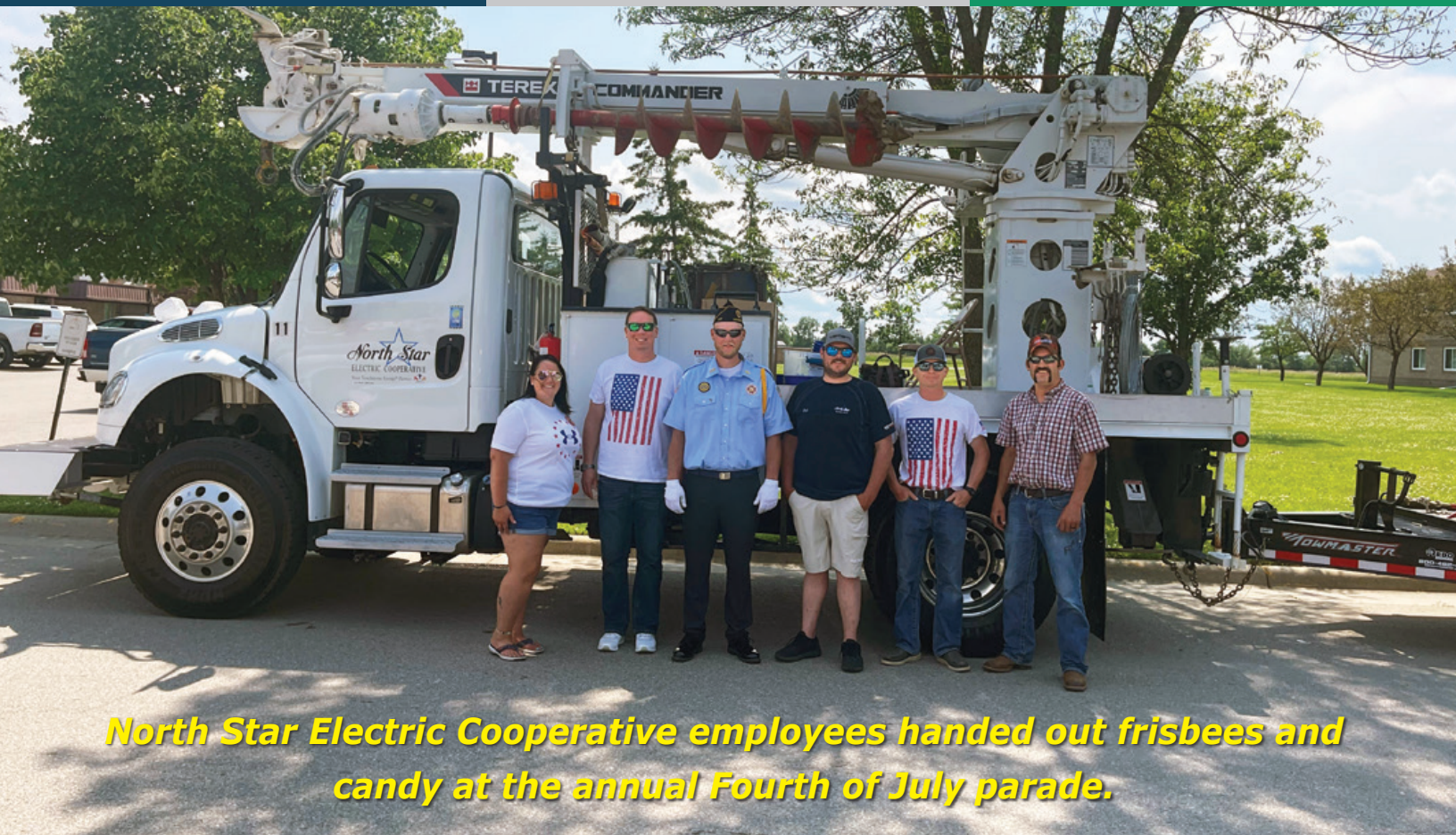
North Star Electric Cooperative employees handed out frisbees and candy at the annual Fourth of July parade.

North Star is proud to celebrate our country's independence!