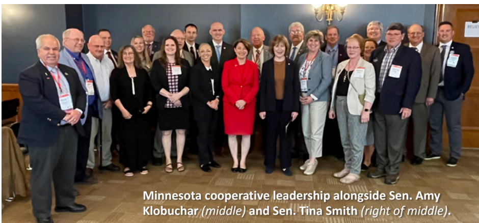
Minnesota cooperative leadership alongside Sen. Amy Klobuchar (middle) and Sen. Tina Smith (right of middle).