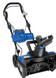
Snow Joe 40V iON Cordless Snow Blower ($299)