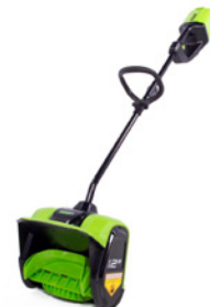
Greenworks 60V Cordless Snow Blower ($149)