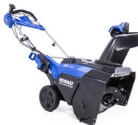
Kobalt 80V MAX Cordless Snow Blower ($399)