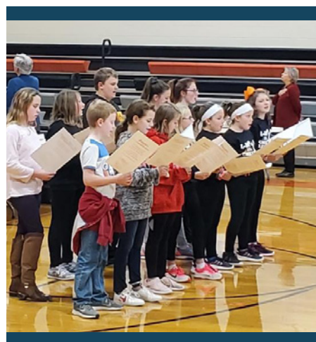
Littlefork-Big Falls fifth and sixth graders sing the national anthem.