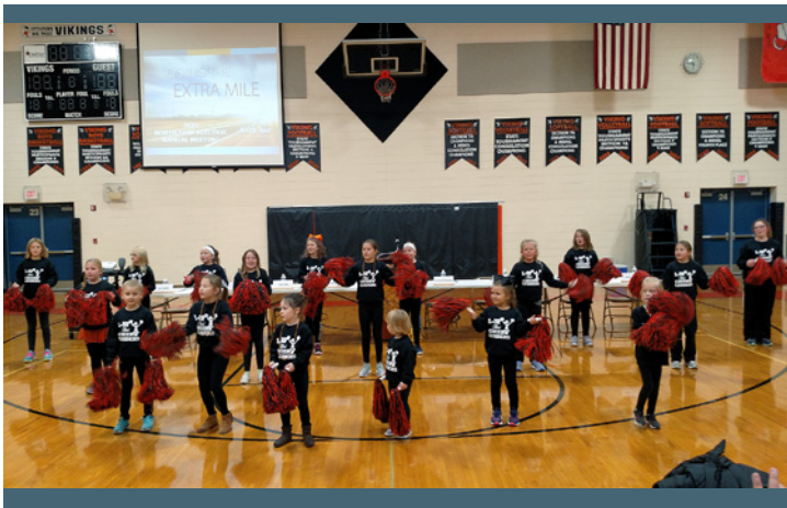
Littlefork-Big Falls Mini Cheerleaders perform.