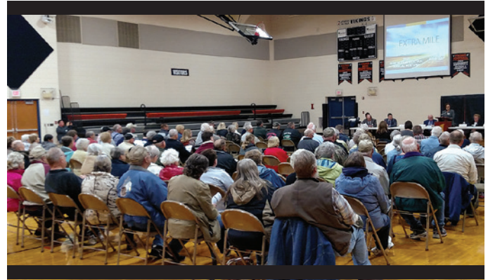
A good-sized crowd gathers for North Star Electric Cooperative's 79 th annual meeting.