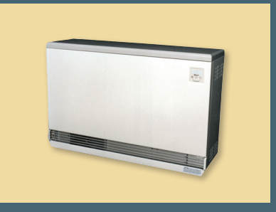
Ideal for any room in your home as supplemental heat or a direct replacement of electric baseboards.