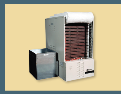
This system heats your home through a central duct system and can be interfaced with a heat pump for greater efficiency.