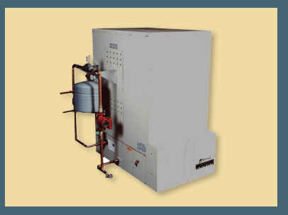
This system heats your home through in-floor radiant baseboards and can be interfaced with forced air.