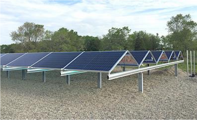
Runestone Electric Association's 44 KW Community Solar Alexandria, MN