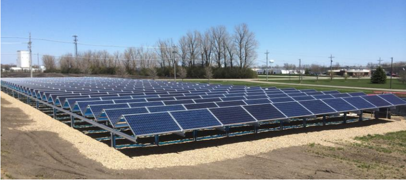
Steele-Waseca Cooperative Electric's 100 kW Sunna Community Solar Garden Owatonna, MN