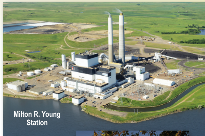
Milton R. Young Station

The cost to members is just $100 per person or $175 per couple. This covers your cost of the bus, hotels, tours and most meals. Members who have not been on this trip in the past are encouraged to go.