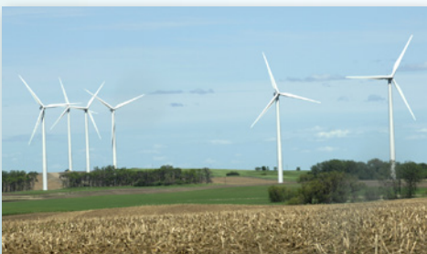
Ashtabula Wind Energy Center