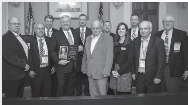
Rep. Collin Peterson and representatives from the Minnkota family.