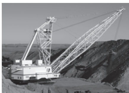
BNI Coal mine

Some of our energy is generated at both sites. The wind towers at Ashtabula are 250 feet tall with 120-foot blades. After that we're off to Grand Forks for lunch and then back home. The cost to members is just $100 per person or $175 per couple, which covers the bus, hotels, tours and meals. Members who have not been on this trip are encouraged to go.