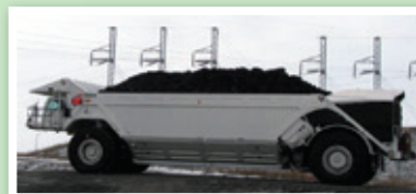
BNI's new 240-ton coal trucks