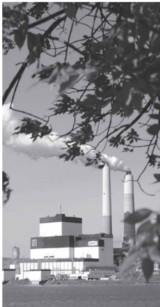
Milton R. Young Station