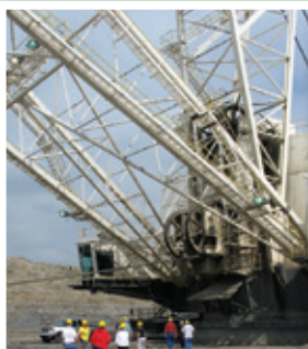
Liberty dragline at the BNI Coal mine